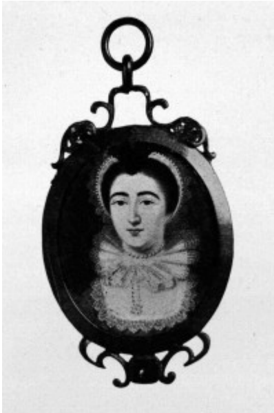
Left: Crofton Miniature early 18th century, related to Mapother of Kiltreevan.

Although the Mapothers arrived in Ireland as settlers and officials during the Tudor Conquest of Ireland, unusually they remained a catholic gentry family. Their catholic faith and landed wealth placed limits on who they could partner with, and they intermarried other recusant families including the Croftons, Ormsbys, Nugents, Kellys and the Taylors of Swords.[2]